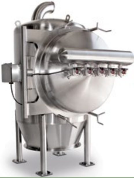
Coperion K-Tron Sanitary Filter Receiver

Basic operation consists of the high pressure rotary valve being filled from another vessel or device by gravity (note that the surge vessel does not need to be a pressure vessel). When the high pressure rotary valve is started, and motive air is supplied to the clean convey line side of the rotary valve line adapter, the material flows into the convey line and to the destination selected. The high pressure rotary valve drastically reduces leakage from the convey line up into the vessel above the high pressure rotary valve. This allows more efficient operation as more motive air is being used to convey material and the minimum amount of air is lost to leakage through the high pressure rotary valve. Dense